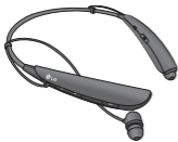
LG TONE PRO™ HBS-750